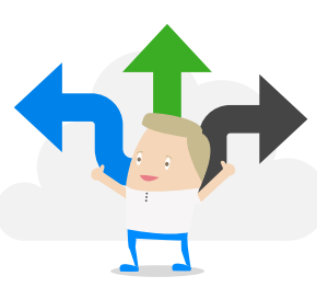
We are pragmatic, transparant and flexible